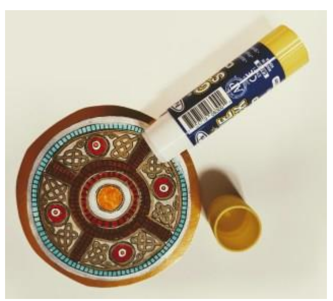
Step 4: You can add some jewels and other finishing touches to really make it sparkle!